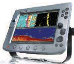
No. RAY E62113US - C120W Display 12"