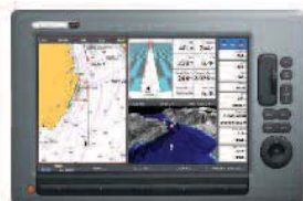
No. RAY E62115US - C140W Display 14"