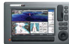
No. RAY E62111US - C90W Display 9"